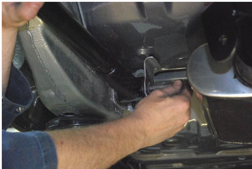
Figure 4: Lowering the trailing arms