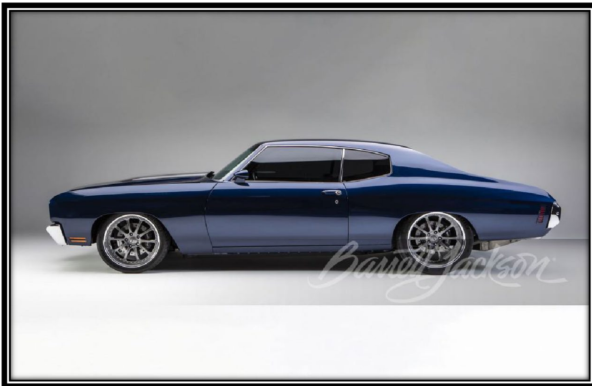
Figure 1: 1970 Chevelle features our A-Body suspension

Congratulations on the purchase of your new Speedtech Performance rear trailing arms. Use only approved and appropriately rated jack and jack stands, and be sure to take all safety precautions required to complete the job safely and correctly. If you have uncertainties, seek the assistance of a highly qualified workshop to assist you.