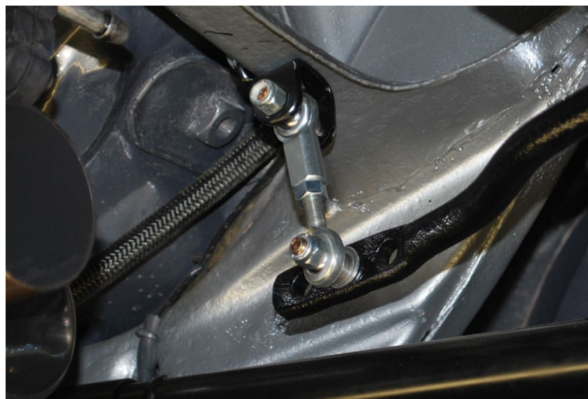
Figure 5: Two images that depict the bolting of the end links