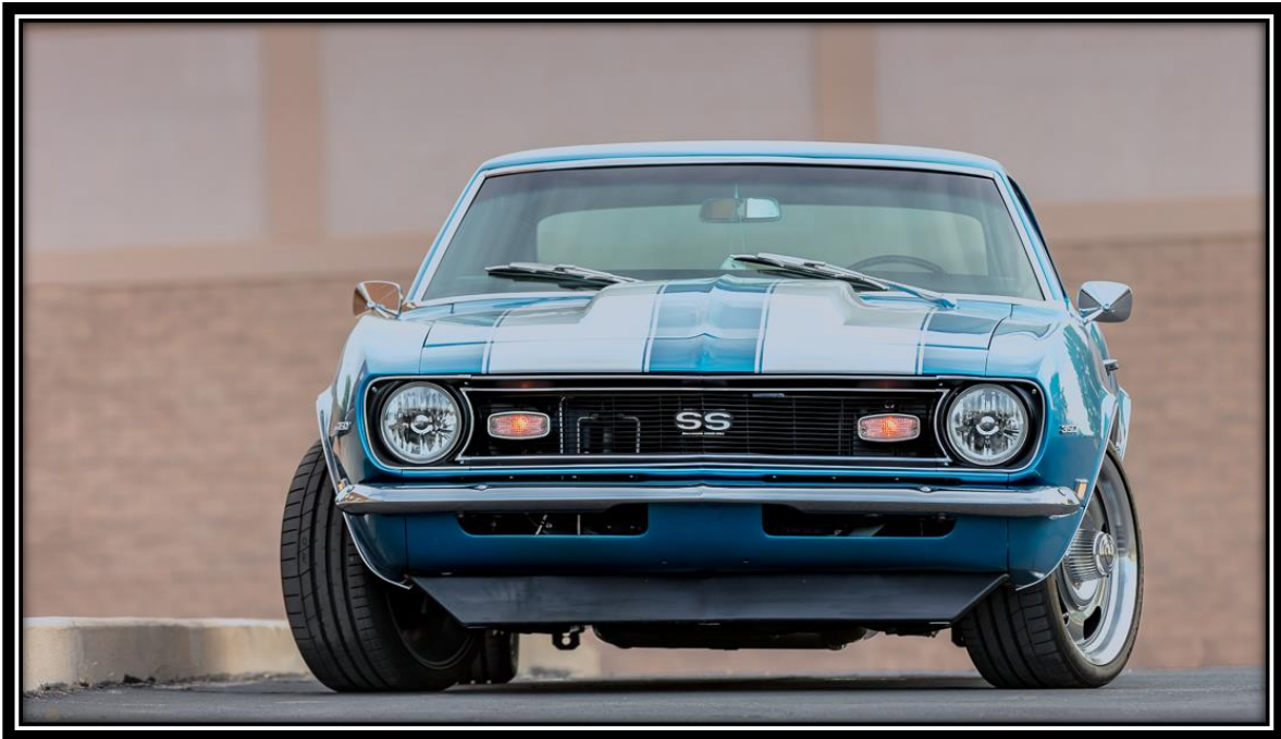
Figure 1 1968 D8nite Camaro, features our GT front suspension and Torque Arm rear suspension

Congratulations on the purchase of your new Speedtech Performance front tubular control arms. Installing this system will require the removal of your old suspension from the car. Use only approved and appropriately rated jack and jack stands, be sure to take all safety precautions required to do the job safely and correctly. If you are unsure seek the assistance of a highly qualified workshop to assist you.