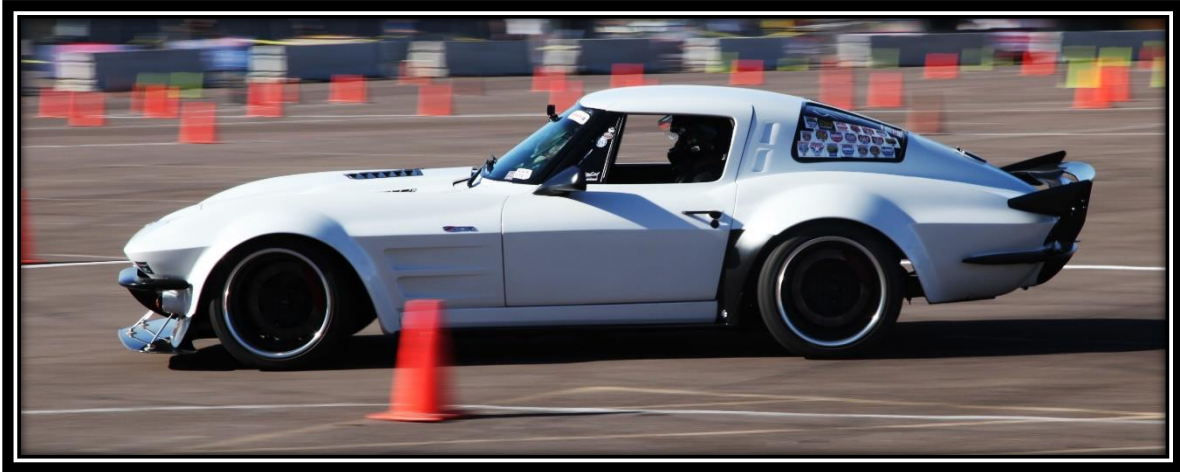
Figure 1 C2 Corvette, features our ExtReme IRS Chassis, and Body Mount Kit

Congratulations on the purchase of your new Speedtech Performance Aluminum Body Mounts. Use only approved and appropriately rated jack and jack stands, be sure to take all safety precautions required to do the job safely and correctly. If you are unsure, seek the assistance of a highly qualified workshop to assist you.