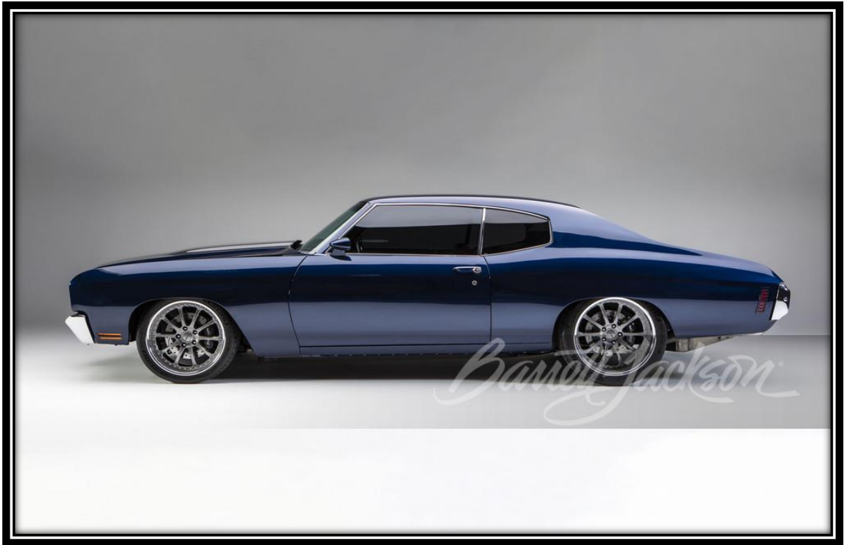
Figure 1 1970 Chevelle, features our A-Body suspension

Congratulations on the purchase of your new Speedtech Performance Trailing Arms. Use only approved and appropriately rated jack and jack stands, be sure to take all safety precautions required to do the job safely and correctly. If you are unsure seek the assistance of a highly qualified workshop to assist you.