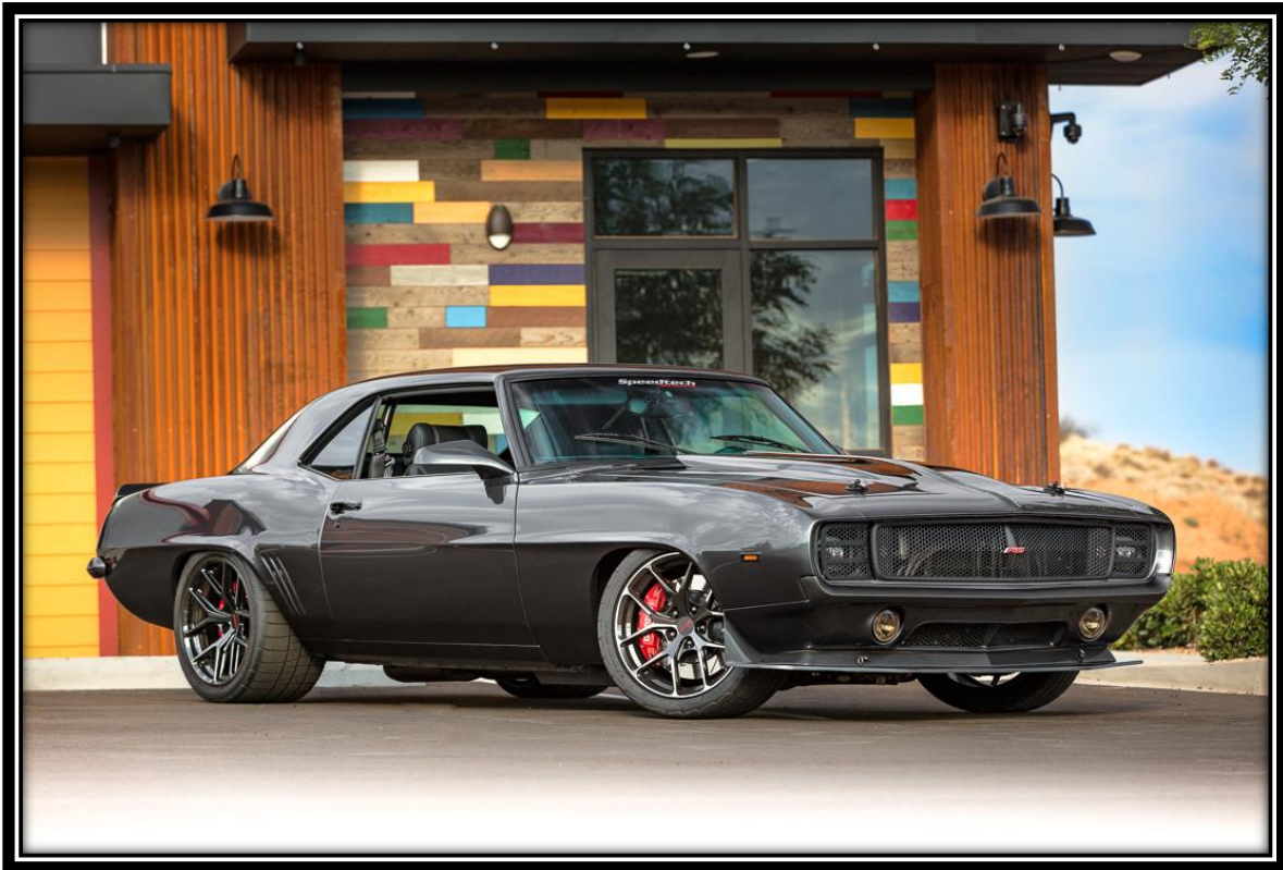
Figure 1 1969 Camaro, features our Body Mounts, Hex Camaro

Congratulations on the purchase of your new Speedtech Performance Aluminum Body Mounts. Use only approved and appropriately rated jack and jack stands, be sure to take all safety precautions required to do the job safely and correctly. If you are unsure, seek the assistance of a highly qualified workshop to assist you.