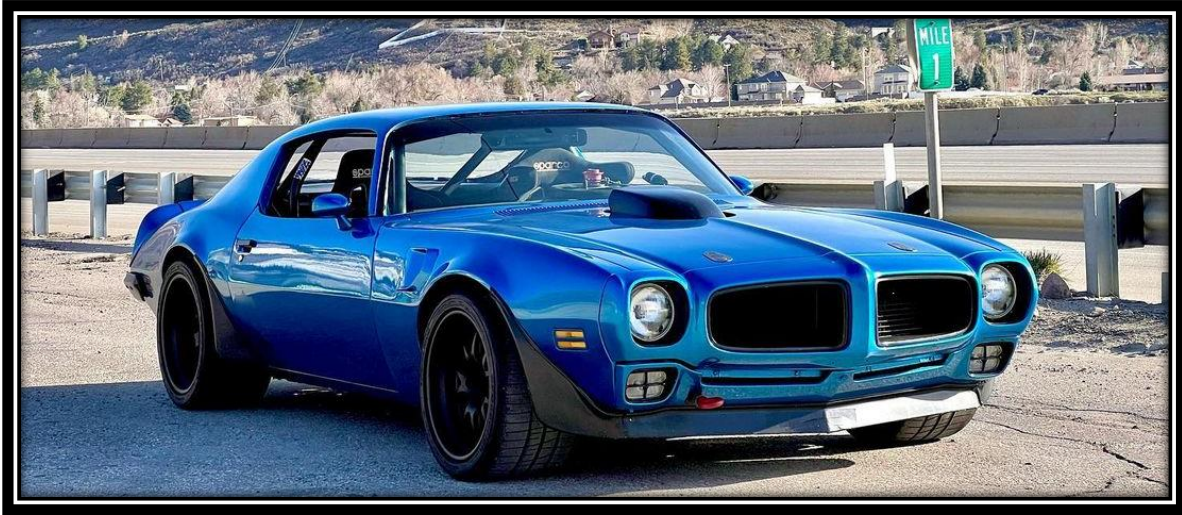
Figure 1 1970 Trans AM, features our Chicane Conversion Brackets

Congratulations on the purchase of your new Speedtech Performance Chicane Coilover Brackets. Installing this system will require the removal of your old suspension from the car. Use only approved and appropriately rated jack and jack stands, be sure to take all safety precautions required to do the job safely and correctly. If you are unsure seek the assistance of a highly qualified workshop to assist you.