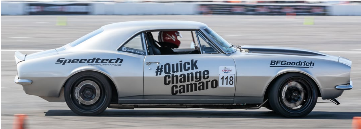
Figure 1: 1967 Quickchange Camaro features our road assault front suspension and torque arm rear suspension

Congratulations on the purchase of your new Speedtech Performance ExtReme upper control arms. Use only approved and appropriately rated jack and jack stands, and be sure to take all safety precautions required to complete the job safely and correctly. If you have uncertainties, seek the assistance of a highly qualified workshop to assist you.