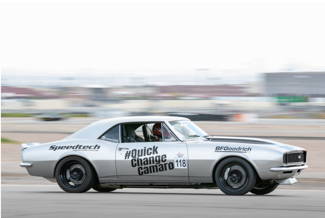
Figure 1: 1967 Camaro features our road assault kit, torque arm, and components

Congratulations on the purchase of your new SpeedtechPerformance tie rod sleeves. Use only approved and appropriately rated jack and jack stands, and be sure to take all safety precautions required to complete the job safely and correctly. If you have uncertainties, seek the assistance of a highly qualified workshop to assist you.