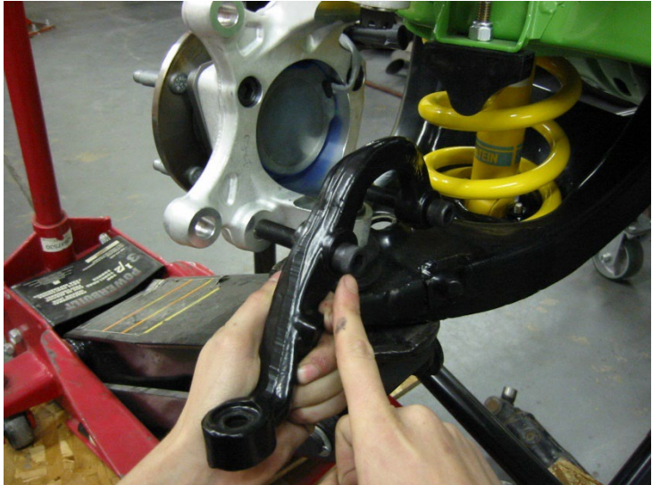
Figure 6: Two images of factory steering arms

NOTE: The Speedtech spindle requires a C5/6 based brake package to be installed. Speedtech recommends Baer or Wilwood brakes. Follow manufacturer's instructions for your specific brake system and be sure to properly bleed the brakes before driving the vehicle.