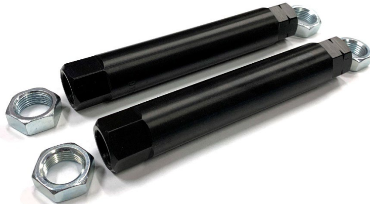
Figure 9: Tie rods

A special length tie rod set is included with factory inner and outer tie rods.