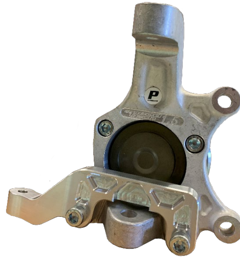
Figure 8: Passenger side tie rod end and steering arm installment