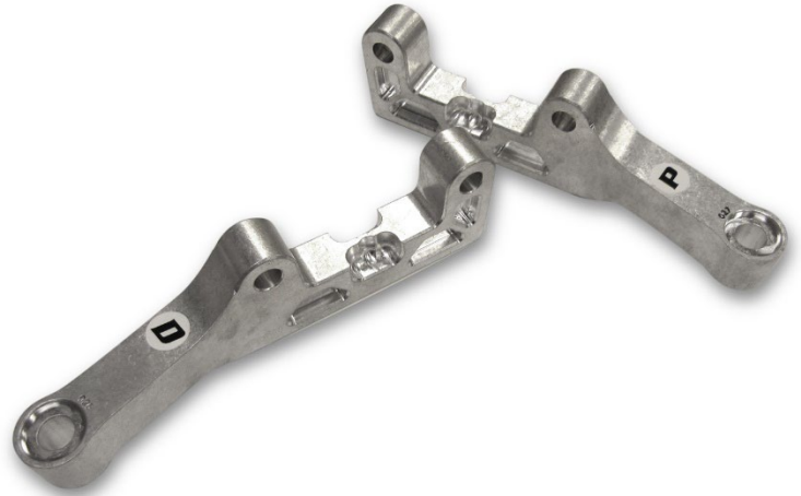
Figure 7: Billet steering arms

Speedtech's new machining modification allows you to install the steering arm on opposite sides with the tie rod end further from the center. This change in steering arm will help improve the Ackermann setting and should be used for auto cross and road race cars.