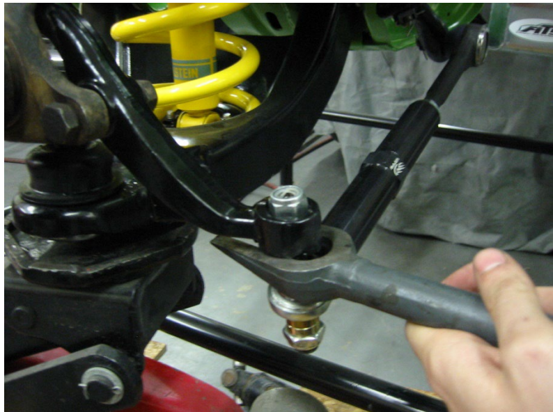
Figure 3: Spindle removal

Once both upper and lower ball joints are broken loose from the spindle, carefully remove the upper ball joint castle nut and spindle from the control arm. Repeat the process for the lower ball joint and remove the factory spindle from the vehicle.