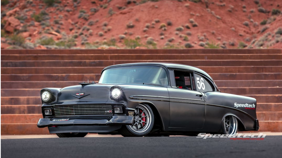
Figure 1: 1956 Bel Air features our ExtReme spindles

Congratulations on the purchase of your new Speedtech Performance spindles. Use only approved and appropriately rated jack and jack stands, and be sure to take all safety precautions required to complete the job safely and correctly. If you have uncertainties, seek the assistance of a highly qualified workshop to assist you.