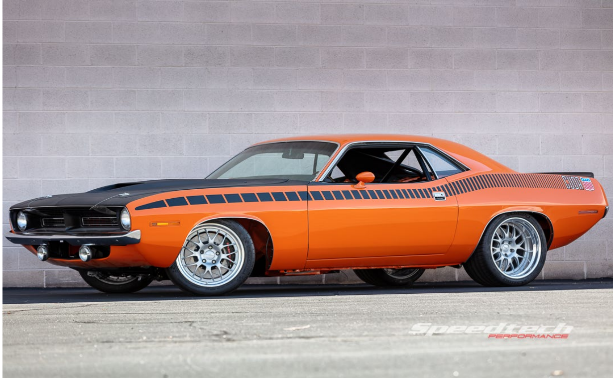
Figure 1: 1970 AAR Cuda, features our ExtReme Subframe and IRS

Congratulations on the purchase of your new Speedtech Performance hemi engine mount adapters. Use only approved and appropriately rated jack and jack stands, and be sure to take all safety precautions required to complete the job safely and correctly. If you have uncertainties, seek the assistance of a highly qualified workshop to assist you.