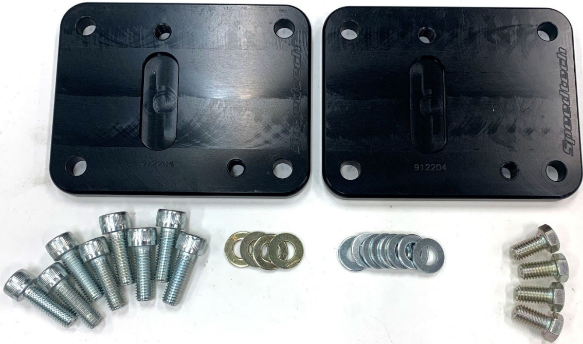
Figure 3: Parts and hardware