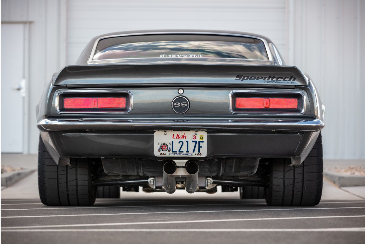
Figure 1: 1967 Camaro features our IRS

Congratulations on the purchase of your new Speedtech Performance IRS sheet metal kit. Use only approved and appropriately rated jack and jack stands, and be sure to take all safety precautions required to complete the job safely and correctly. If you have uncertainties, seek the assistance of a highly qualified workshop to assist you.