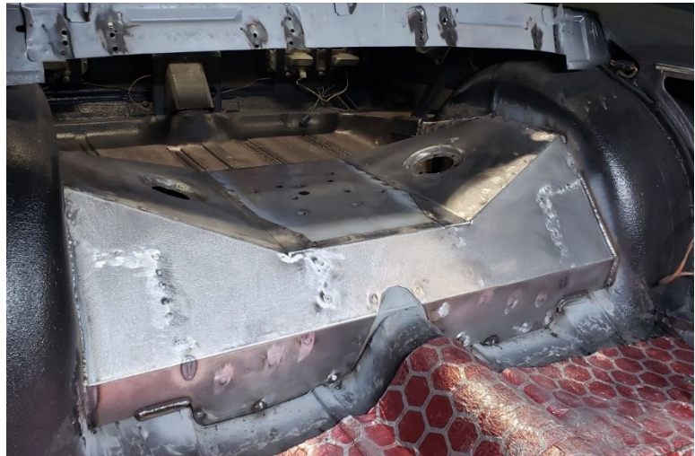
Figure 4: Welding

You will repeat this process for the top and back plates as well.