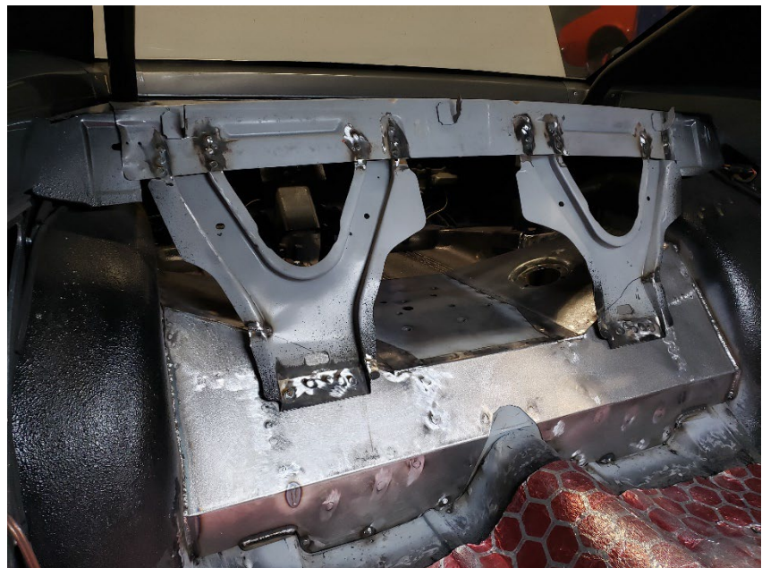
Figure 5: Package tray

NOTE: Your rear seat frame will require modification to install. Each application may vary depending on what interior you have as well as which enclosure option you choose.