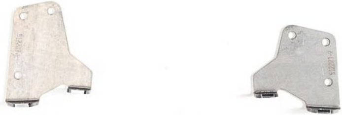
Figure 4: Brackets

NOTE: The shorter bracket goes on the passenger side, and the taller bracket goes on the driver's side.