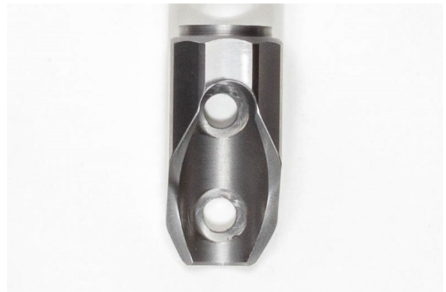
Figure 3: Lower mount

Start by bolting the lower mount to the subframe boss in front of the shock using the supplied 7/16 x 1 1/4 socket head cap screws.