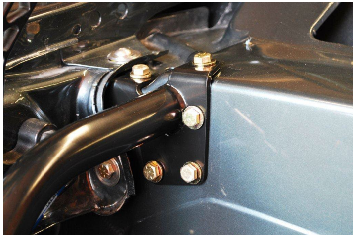
Figure 5: Finished assembly

Prep and coat with your choice of paint, powder coat or other appropriate material then reinstall the Speedtech Performance down bars into vehicle.