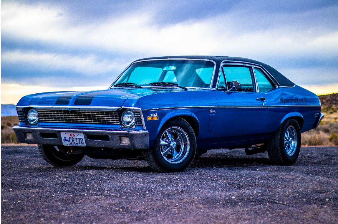
Figure 1: 1969 Nova features our body mounts

Congratulations on the purchase of your new Speedtech Performance ExtReme aluminum body mounts. Use only approved and appropriately rated jack and jack stands, and be sure to take all safety precautions required to complete the job safely and correctly. If you have uncertainties, seek the assistance of a highly qualified workshop to assist you.