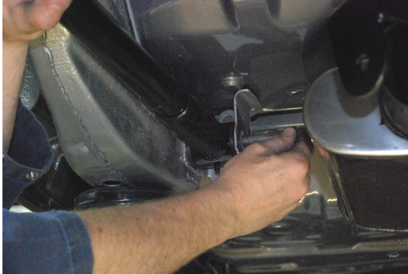
Figure 4: Lowering the trailing arms