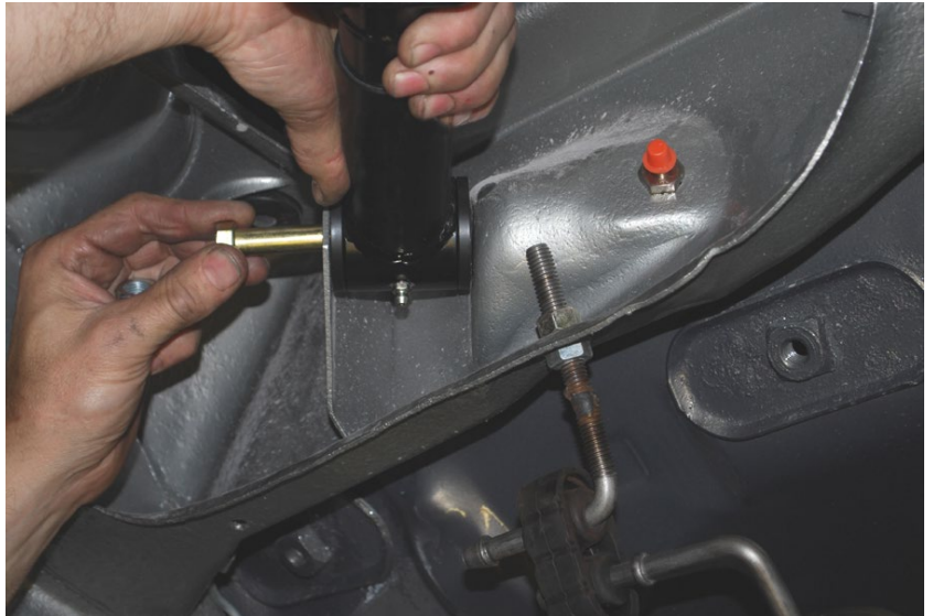
Figure 3: Grease fitting pointing downward

Using the new bolts install the Speedtech upper trailing arms with the grease fitting pointing downward.