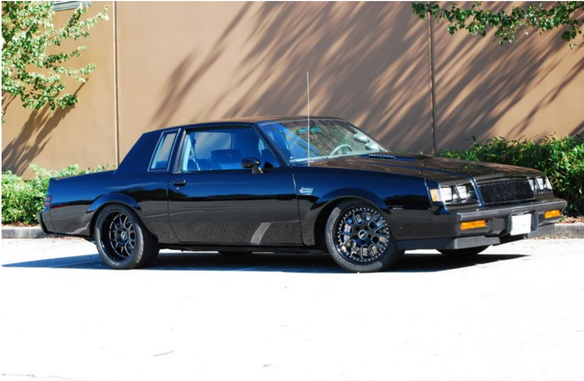
Figure 1: 1987 Grand National, features our G-Body suspension, Blake Foster

Congratulations on the purchase of your new Speedtech Performance rear trailing arms. Use only approved and appropriately rated jack and jack stands, and be sure to take all safety precautions required to complete the job safely and correctly. If you have uncertainties, seek the assistance of a highly qualified workshop to assist you.